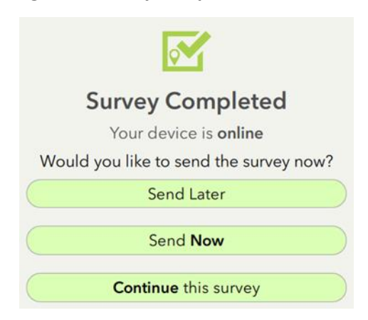
Figure 2. Survey Completed