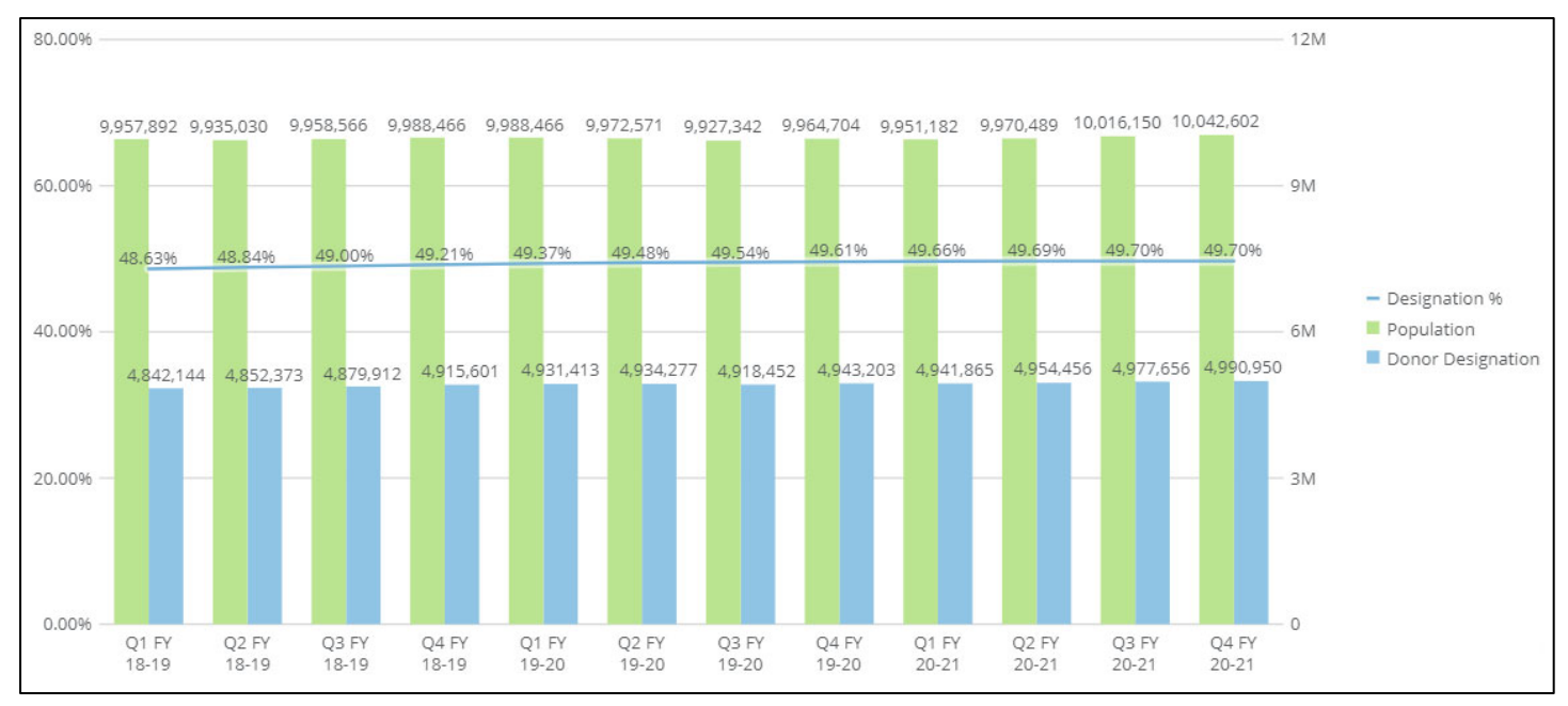
Figure 7: PA Organ Donor Designation Share