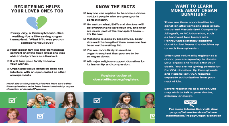
Figure 3: Redesigned organ donation brochure/mailer

In addition to the new content strategy, Tierney completed a refresh for the PennDOT mailer, using a brighter, more captivating design to get the attention of the target audience and more effectively communicate the message. Alongside Red House, Tierney finalized the refreshed PennDOT mailer in English and Spanish. The final document was uploaded to the DLPA website and mailers continue to be distributed by PennDOT.