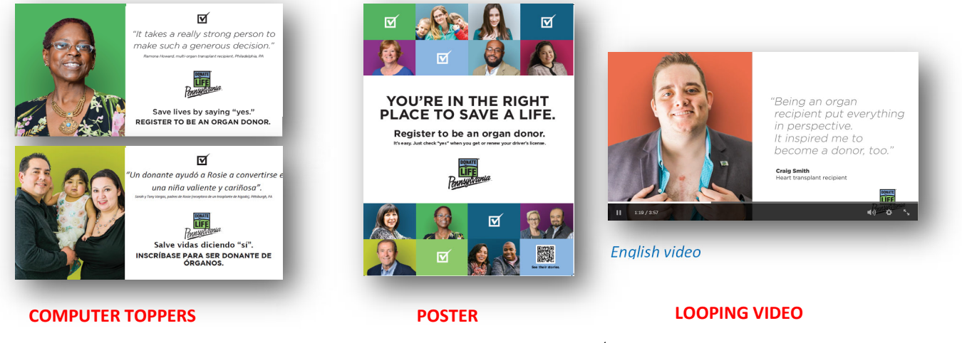
Figure 4: New creative assets for DMV centers

Tierney and Red House also created new assets for Department of Motor Vehicle (DMV) sites, including posters, computer toppers, and new looping videos with key myth-busting facts to be featured on DMV screens both in English and Spanish. Highlighting participants from the updated DMV mailer, these assets raise awareness and encourage individuals to register as organ donors when in DMV centers.