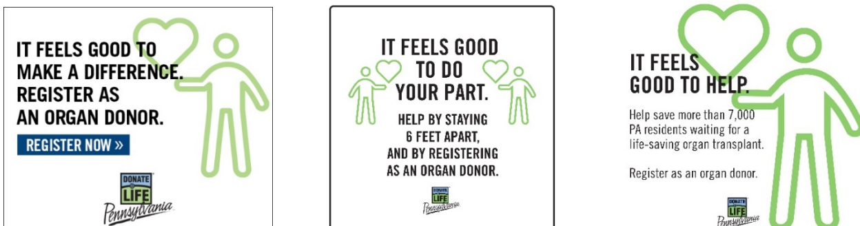
Figure 5: Redesign of creative assets

In response to the COVID-19 pandemic and recognizing the need for a refined tone, interim digital creative assets were developed in May and will be used in market through the end of 2020. The assets are also being placed in Department of Motor Vehicle (DMV) centers throughout Pennsylvania as social distance markers and window clings. The creative highlights the insight that COVID-19 has shown consumers that individuals can be part of the solution.