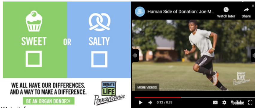
Figure 4: Differences and Human Side Campaign Creative Donate Life PA Website

This year also saw a shift in creative strategy. From July 2019 through mid-June 2020, the media team used creative for the “Differences” campaign based on the strategy from the previous year. The “Differences” campaign highlighted the fact that, although everyone has different interests, appetites and skills, there is still one thing people have in common – the ability to get on the right side of organ donation and make a difference for others by becoming a donor.