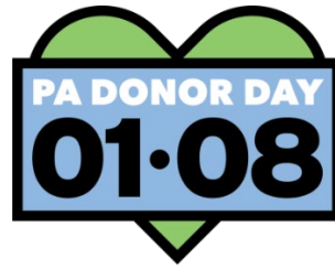
Figure 3: PA Donor Day Creative Design