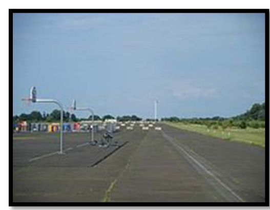
Safety Town- public domain