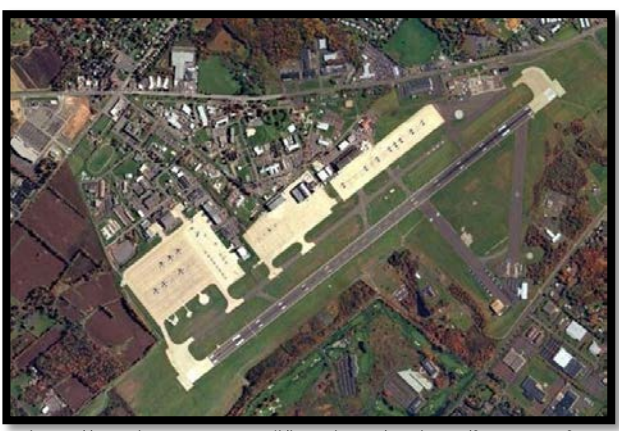
https://www.bracpmo.navy.mil/brac_bases/northeast/former_warfa e center warminster.html