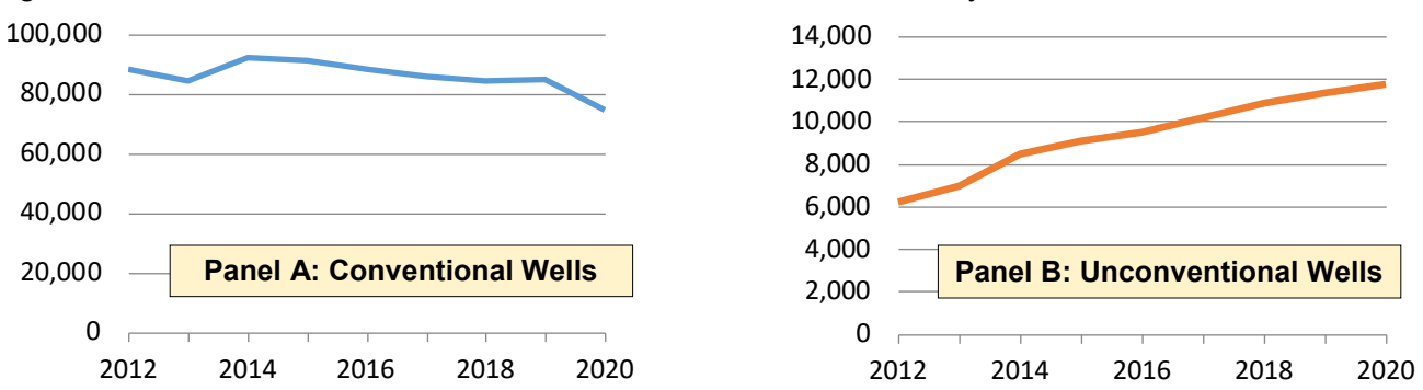
Figure 3. Total Number of Active Oil and Natural Gas Wells in Pennsylvania, 2012 to 2020

The tables below show data for counties with more than 500 active unconventional oil and natural gas wells as of June 30, 2021.