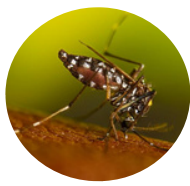
Aedes aegypti Aedes albopictus

These mosquitoes usually live in tropical or subtropical areas of the world. They can be found in parts of the US.