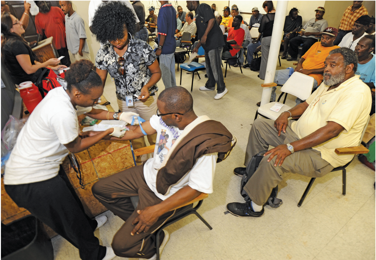
Health workers from the Duval County Health Department and other Florida health agencies test homeless citizens for tuberculosis in downtown Jacksonville.

been in close contact with the nurse are of special concern to the health department. Clinic staff members are concerned about the risk of transmitting tuberculosis to their own families.