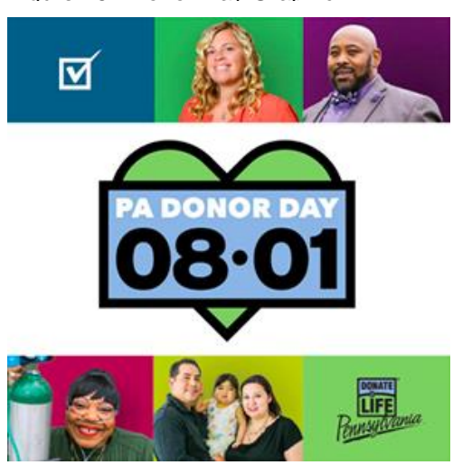
Figure #5: Donor Day Graphic

Source: Bravo Group PA Donor Day 2023 Report<sup>4</sup>