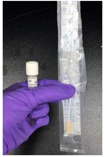
Figure 1: eSwab®