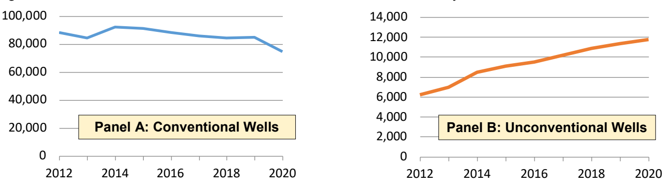
Figure 3. Total Number of Active Oil and Natural Gas Wells in Pennsylvania, 2012 to 2020

The tables below show data for counties with more than 500 active unconventional oil and natural gas wells as of March 31, 2021.