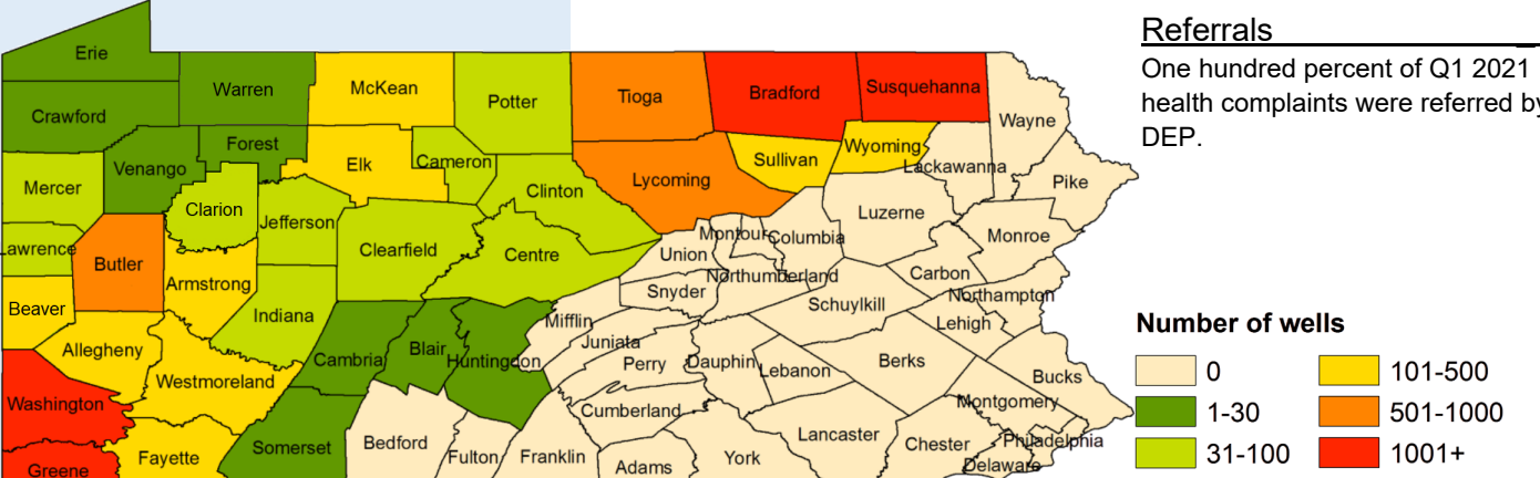
Figure 2. Active Unconventional Oil and Natural Gas Wells in Pennsylvania, as of March 31. 2021*