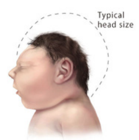
Baby with Severe Microcephaly