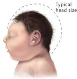
Baby with Microcephaly