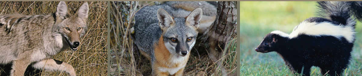
Pictured are some of the wildlife species that commonly spread rabies—coyote, fox, and skunk.

WS established its National Rabies Management Program in recognition of the changing scope of rabies. The program aims to prevent the further spread of rabies by containing the raccoon variant and, eventually, to eliminate terrestrial rabies in the United States through an integrated program involving the use of oral rabies vaccination (ORV) of wildlife.