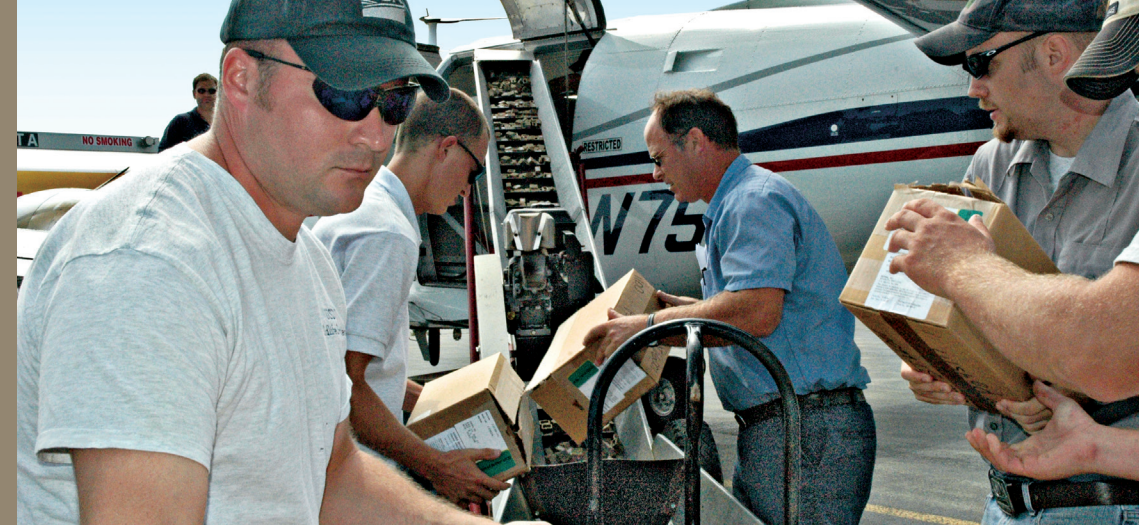
Aerial drops of ORV baits are the most cost-effective way to distribute vaccine in rural areas. Here, WS employees load baits onto a fixed-wing aircraft.