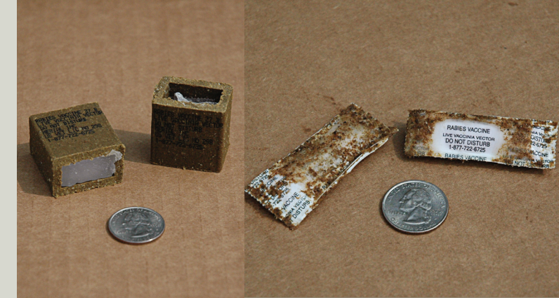
Fishmeal-polymer bait (left) and a coated sachet (right).