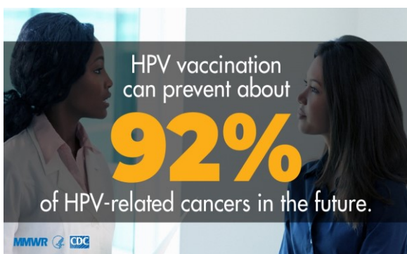
There Is No Screening for Most Cancers Caused by HPV